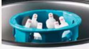
illustrated with blood collection tubes