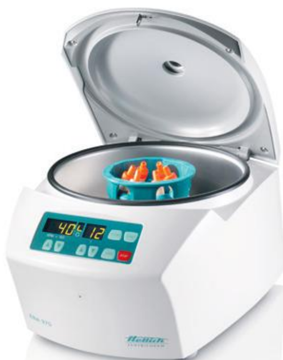
EBA 270 Small centrifuge

In addition, it is used in environmental analysis for clarification of water and soil samples. In schools and other educational institutions it can serve as a low-cost centrifuge for instruction.